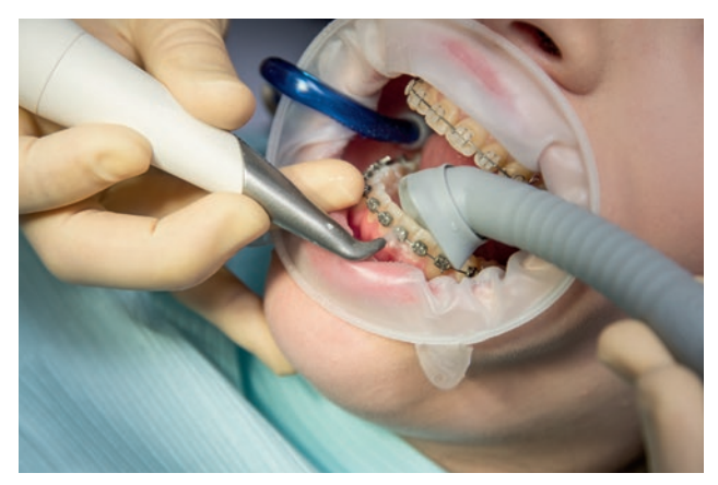
Focussed flow pattern with extremely favourable jet angle even for inaccessible areas.

The nozzle opening has an ideal opening angle and focuses the powder flow precisely on a large