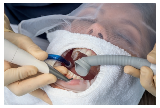
The Supra nozzle can be rotated through 360°. This means that all dental areas are easily accessible.