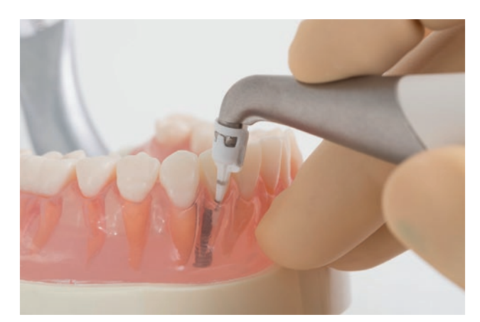
The depth marks match the WHO probe. The Perio tip therefore provides safety in deep cleaning.

The best you can do with a premium product is to enhance its already-outstanding features. MyLunos<sup>®</sup> gets ready for subgingival applications.